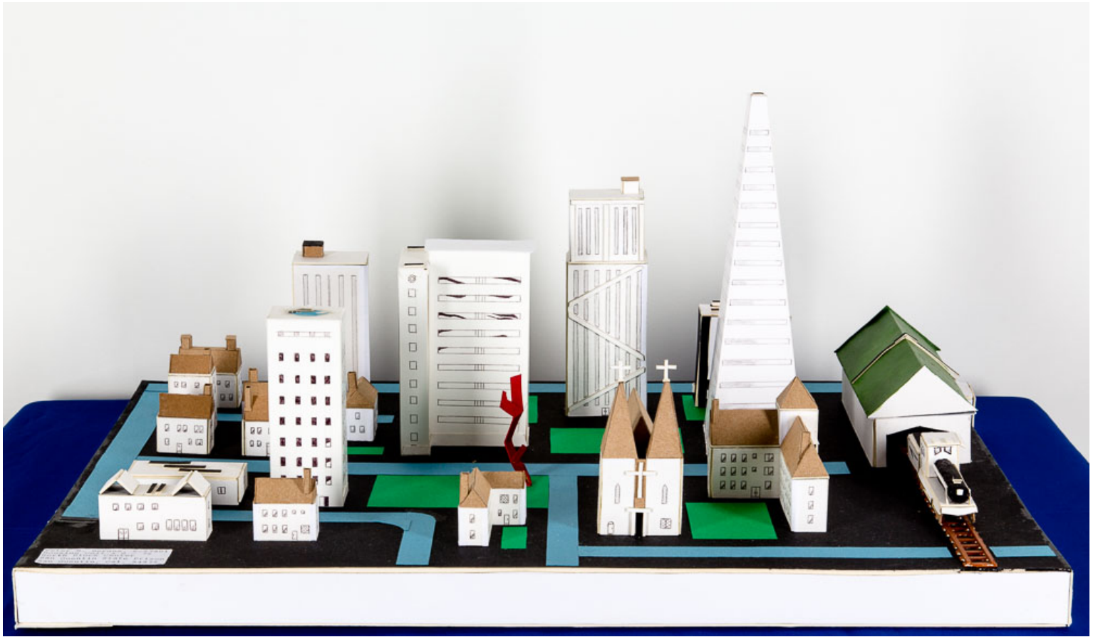
Artwork created by Arts in Corrections classes at San Quentin State Prison