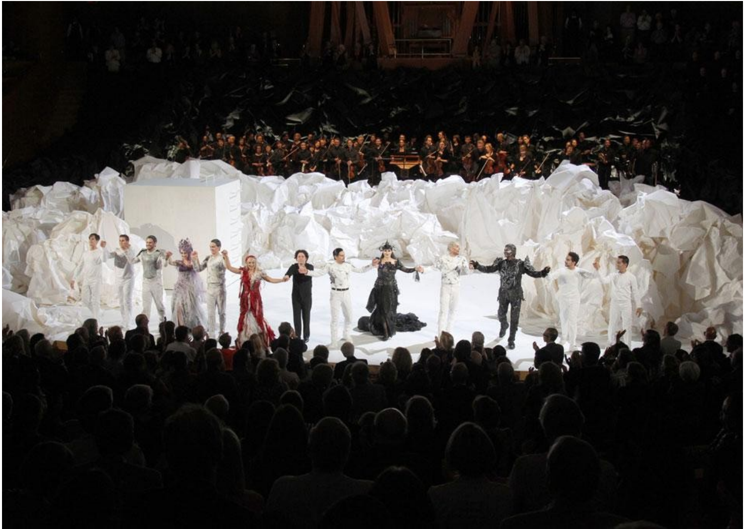
Frank Gehry Paper Stage design for a 2008 performance of Don Giovanni by Mozart