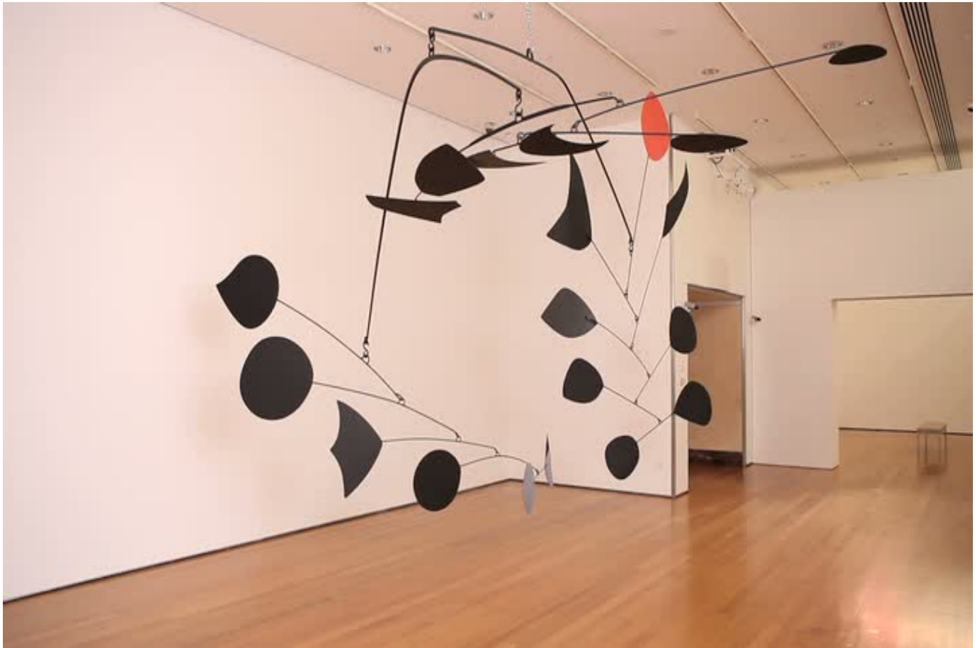
Alexander Calder Rouge Triomphant , 1959–1965 Sheet metal, rod, and paint