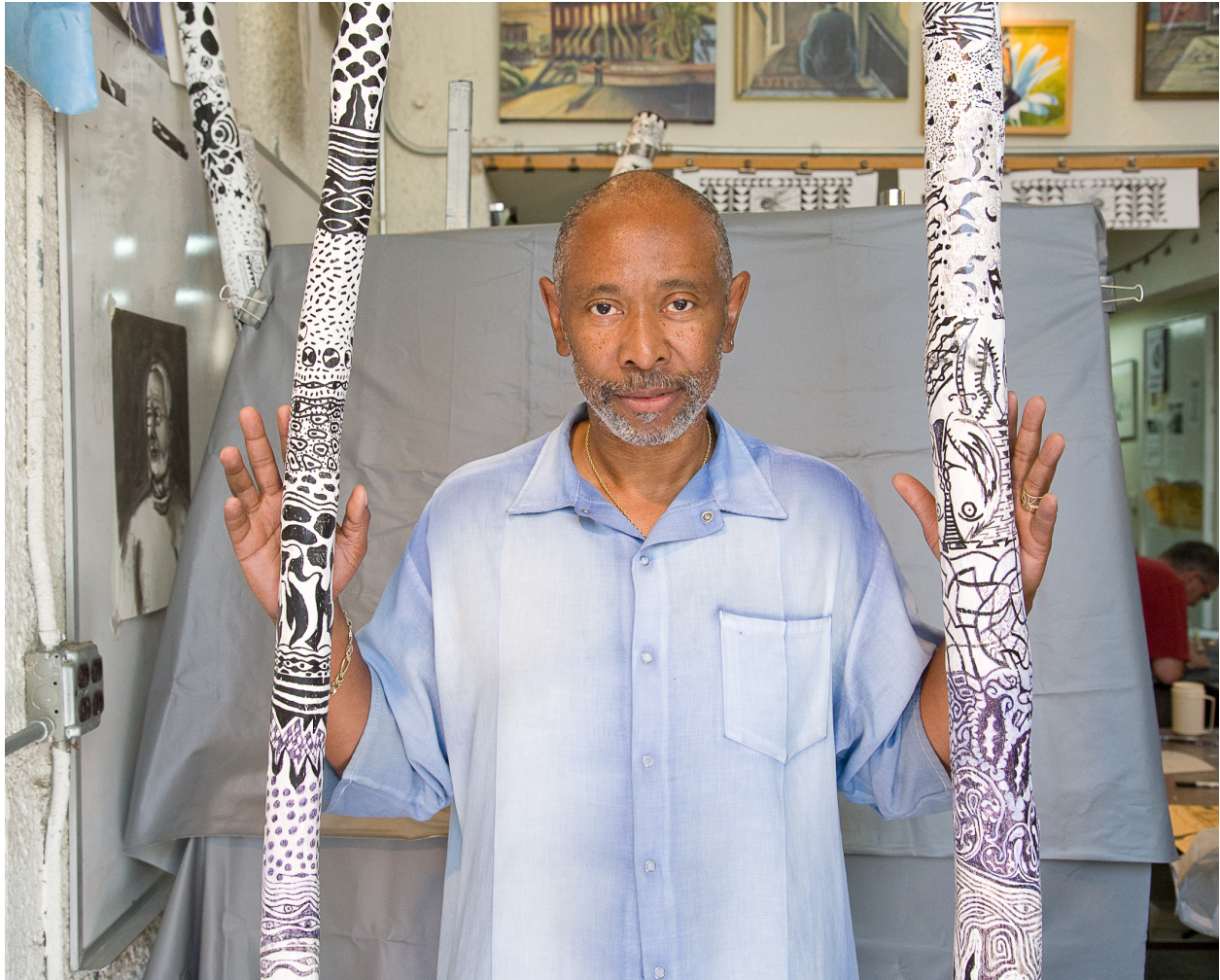
Artwork created by Arts in Corrections classes at San Quentin State Prison