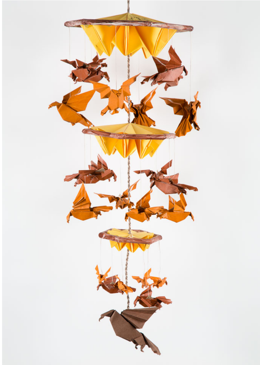
Artwork created by Arts in Corrections classes at San Quentin State Prison