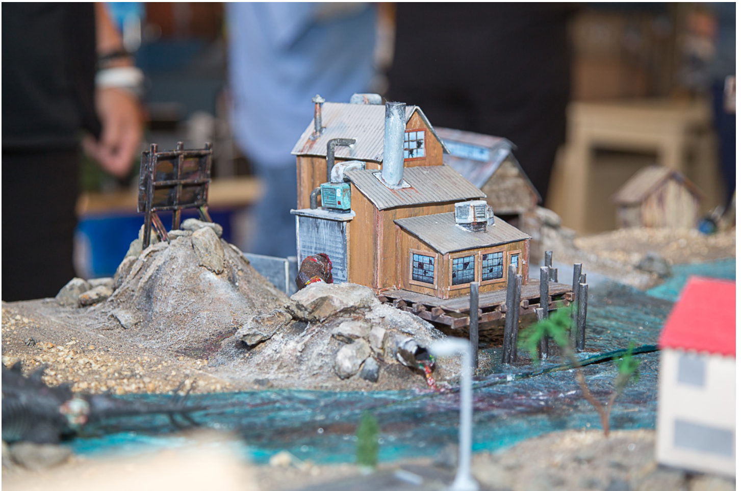
Artwork created by Arts in Corrections classes at San Quentin State Prison