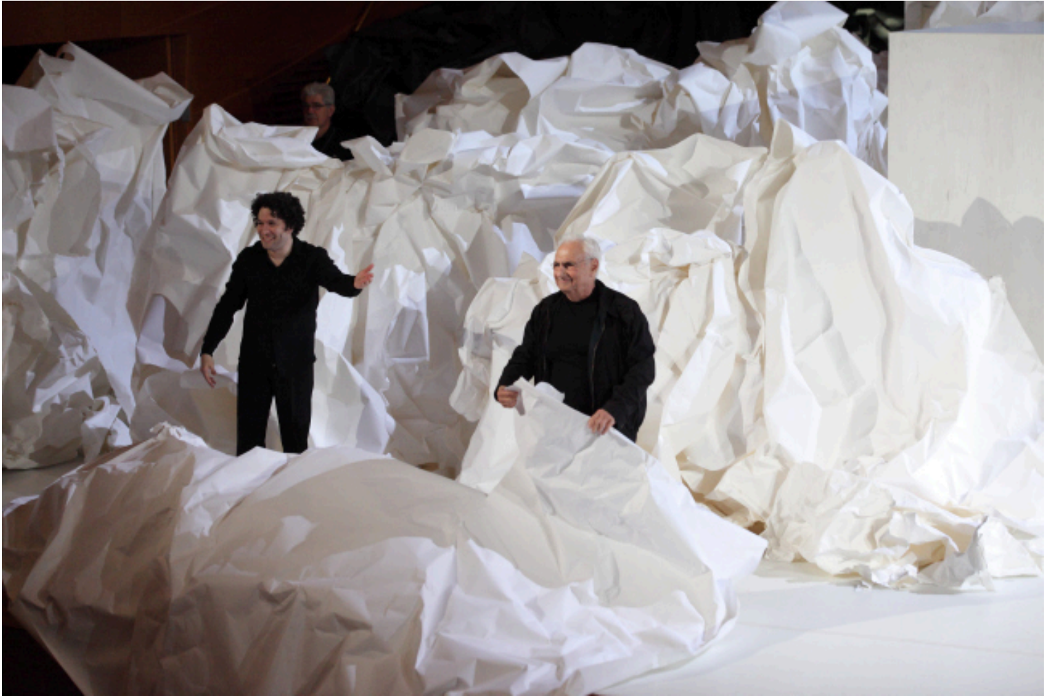
Frank Gehry Paper Stage design for a 2008 performance of Don Giovanni by Mozart