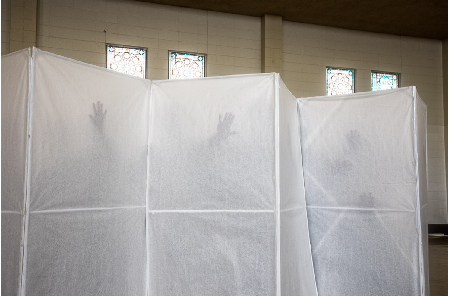
Structure construction by an art class at San Quentin State Prison