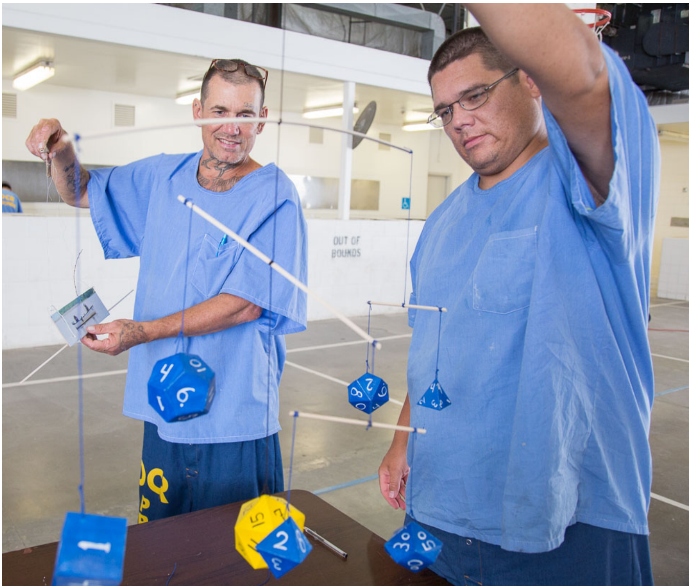
Artwork created by Arts in Corrections classes at Donovan State Prison