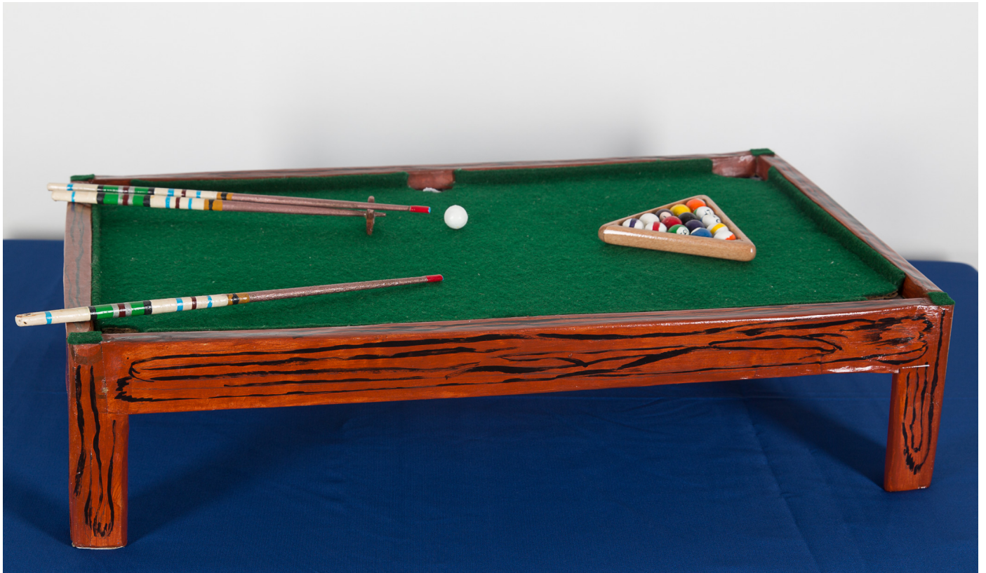
Artwork created by Arts in Corrections classes at San Quentin State Prison