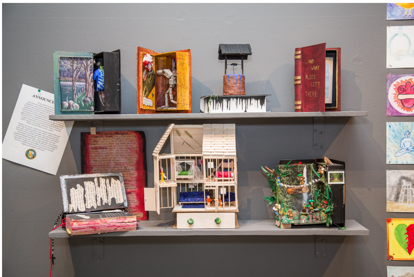
Artwork created by Arts in Corrections classes at Donovan State Prison