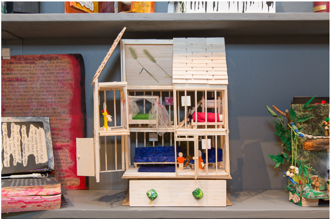
Artwork created by Arts in Corrections classes at Donovan State Prison