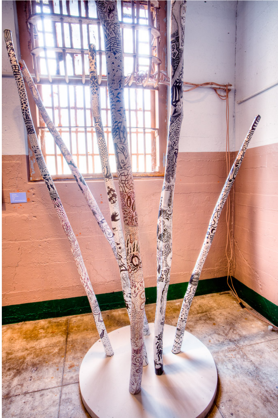
Artwork created by Arts in Corrections classes at San Quentin State Prison