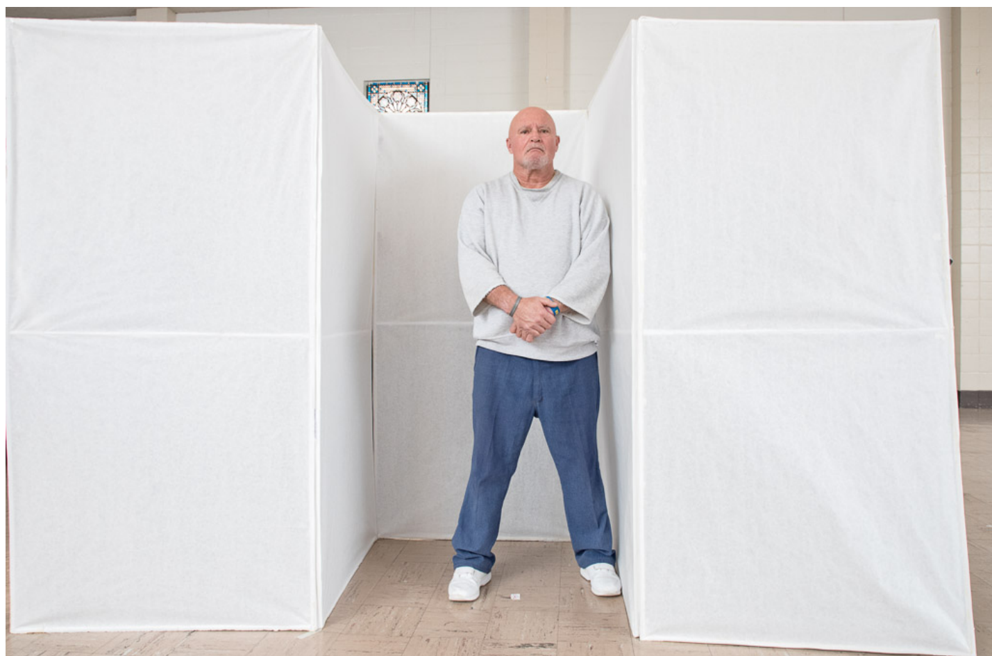
Structure construction by an art class at San Quentin State Prison